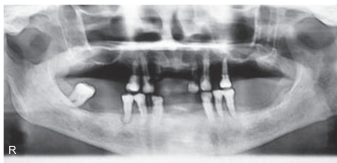
Fig. 1: Preoperative radiograph of patient