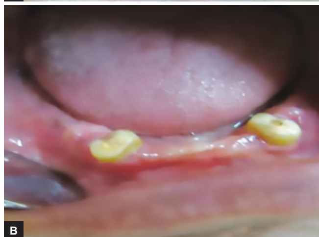
Figs 2A and B: Overdenture abutments