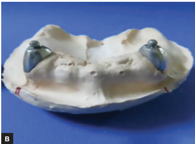
Figs 3A and B: Ball and socket attachments after finishing