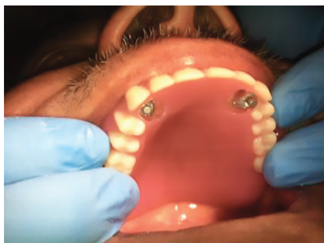
Fig. 5: Evaluation of dentures for female part attachment

coping, endodontic therapy followed by cast coping, and endodontic therapy followed by some form of attachment. The decision of using attachments is made for selective patients having significant amount of bone loss and desires improvement in retention. 5