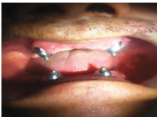
Fig. 4: Ball and socket attachments cemented