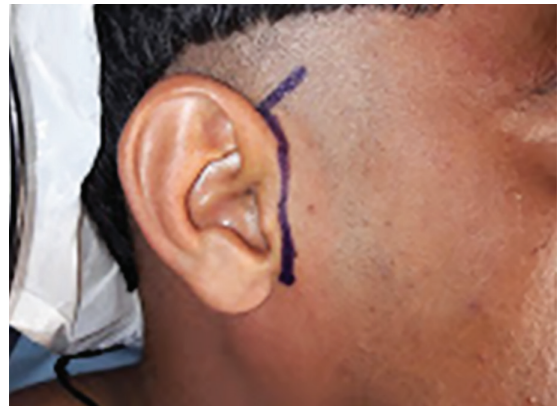
Fig. 2: Incision marking