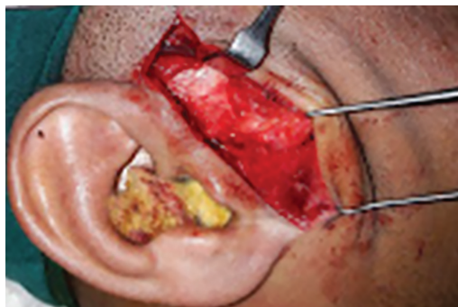
Fig. 3: Surgical exposure