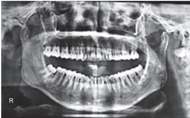
Fig. 1: Bilateral condylar dislocation (preoperative OPG)